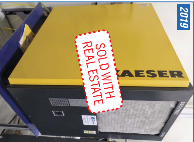
KAESER TD61 REFRIGERATED AIR DRYER