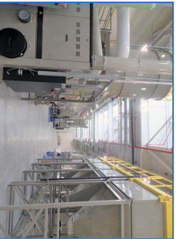
VIEW OF CONAIR RESIN DRYING AND HANDLING SYSTEMS