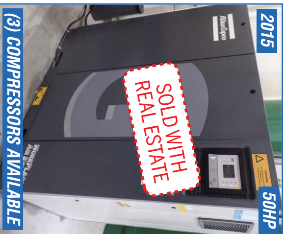
ATLAS COPCO GA37VSD FF COMPRESSOR