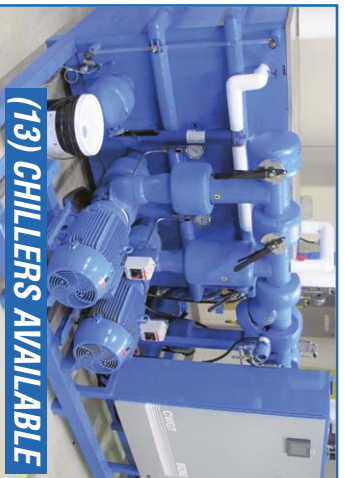
PARTIAL VIEW OF BERG CHILLER SYSTEMS