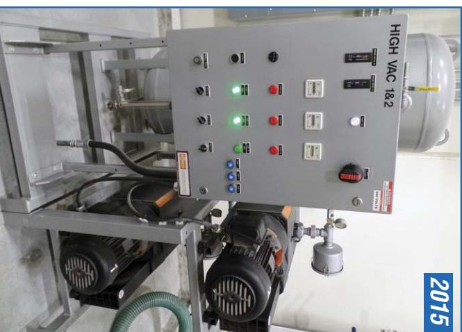
BUSCH HIGH VAC PUMP SYSTEM