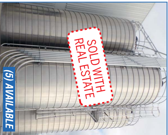
PARTIAL VIEW OF S/S SILOS

CONAIR Dryer System #5, CONAIR W2400 Dryer Unit, s/n 304335, TouchView Control, ABB Drive, CONAIR 142218L4701900 Hopper/Holding Unit, CONAIR Loader, Dryer Capacity Level Control, CONAIR CGT-500 Gastrac Process Air Heater, s/n 303780, Natural Gas, 500,000 BTU/Hr Max, Gastrac Control CONAIR Dryer System #1, CONAIR W1300 Dryer Unit, s/n 304080, TouchView Control, ABB Drive, CONAIR 142218L470P100 Hopper/Holding Unit w/ Support Structure, s/n 305149, Dryer Capacity Level Control, CONAIR Loader, CONAIR Gastrac Process Air Heater Model CGT-350, s/n 303781, Natural Gas, 350,000 BTU/Hr Max, CONAIR GasTrac Control